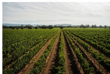
Sangiaco Vella Vineyard Sonoma/Carneros

Planted in 1997, Vella Vineyard is one of the Sangiacomo's biggest vineyards and was the first of their vineyards to be planted with newer French clones and rootstocks. Soils are Zamora silty loam and Wright loam. The vineyard is planted with fifteen combinations of clones and rootstock.