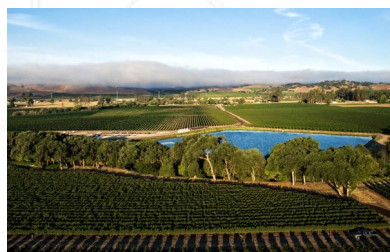
Sangiaco Kiser Vineyard Sonoma/Carneros

With 170 planted acres, Kiser is one of the largest of the Sangiacomos' vineyards. It was the first existing vineyard purchased by the Sangiacomo family and played a key role during the critical expansion of their grape growing business in the 1980s. First planted in 1974, Kiser is set on a rolling slope, with Zamora and Huichica soils. Both Rodgers and Fowler Creeks run through the vineyard. There are more than twenty combinations of clone and rootstocks