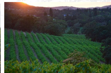
MacLeod Family Vineyard Kenwood, Sonoma Valley

Our vineyard partner for our Sauvignon blanc program is the MacLeod Family and their vineyard located by the town of Kenwood in Sonoma Valley. This vineyard produces Sauvignon Blanc that has intense fruit forward qualities and is blended in with delicate cooler climate grapes from Southern Sonoma Valley.