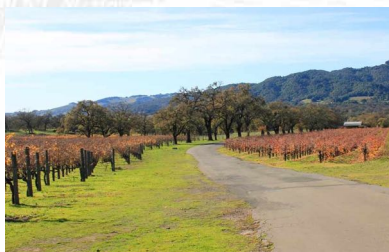
Serres Ranch Sonoma Valley

Serres Ranch was established in 1924 in Sonoma, CA. The ranch is nestled in the Valley of the Moon, where surrounding mountains narrow down to the smallest part of the valley, creating its own unique micro climate suitable for growing world class red wines.